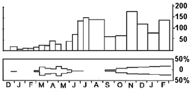
Figure 3 Total number of gastropods collected (top) and Anisus vorticulus relative frequency (bottom) in an abandoned meander of the Rhone floodplain (France) studied from December 1976 to February 1978. Modified from Yacine-Kassab (1979).

There is no information available on reproduction and life cycle in other habitats.